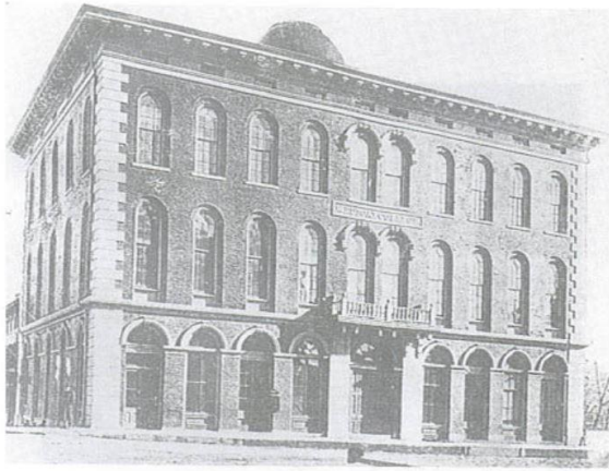
Keokuk Medical College Keokuk, Iowa